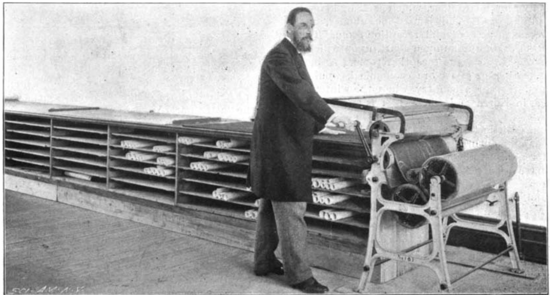
FIXING THE PATTERN-MARKS UPON THE CLOTH.