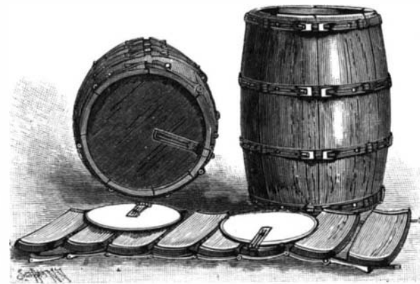
MAYOTTE'S KNOCKDOWN CASK.

When it is desired to return an empty cask, the