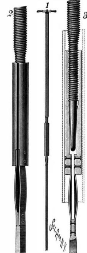
Fig. 1 shows the expander-rod and expanding-tube screwed together. Fig. 2 is a perspective view showing part of the device. Fig. 3 is a longitudinal section through a gun-barrel with the device in operative position, the gun-barrel being shown in dotted lines.

In order to provide a means for removing the dents or depressions from gun-barrels, Henry H. Hotz, of Cuero, Tex., has invented a simple device which, by means of an expander-rod and expanding-tube, forces the indented portions outwardly.