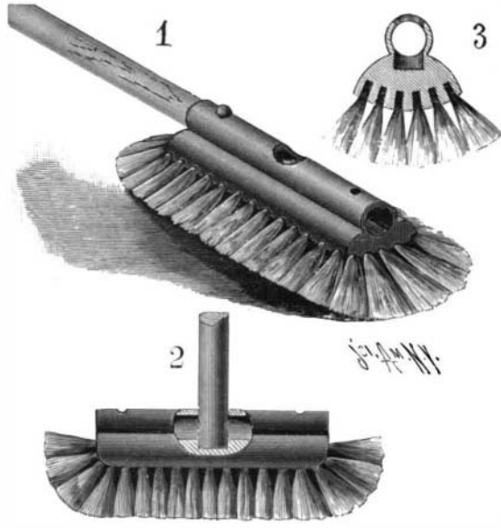
HAM'S CONVERTIBLE DUSTING-BRUSH.

The dust-brush is provided with a tubular portion open at both ends, into which a double-ended handle is