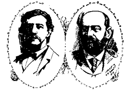
Augustin Daly Maurice Grau CHARLES FROHMAN.