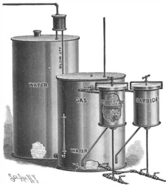
KEISER'S AUTOMATIC ACETYLENE-APPARATUS.

The gas generated by the carbide passes into the gasometer, and is then distributed by a service-pipe. As the gasometer and carbide-chamber communicate with each other, the pressure in both must be the same. When the volume of gas in the generator decreases, the water from the pressure-tank causes the water in the gasometer to rise and to force the water in the bottom of the generating-chambers into contact with the carbide. The gas thereby generated, upon entering the gasometer, depresses the water therein, and withdraws