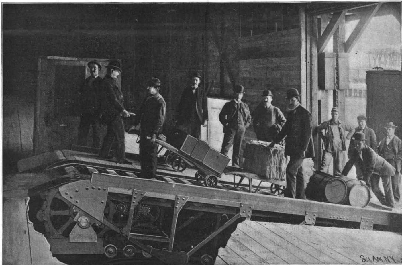
FREIGHT RAMP IN OPERATION.

IN France the annual consumption of matches is about 900 per head of the population. About 33,000,000 matches were made in France in 1897 and about 45,500,000 were imported. The state has a monopoly for the sale of matches and tobacco. The sale of matches in 1897 brought a profit of about $4,000,000, and the tobacco monopoly a net income of $65,000,000. — La Vie Scientifique.