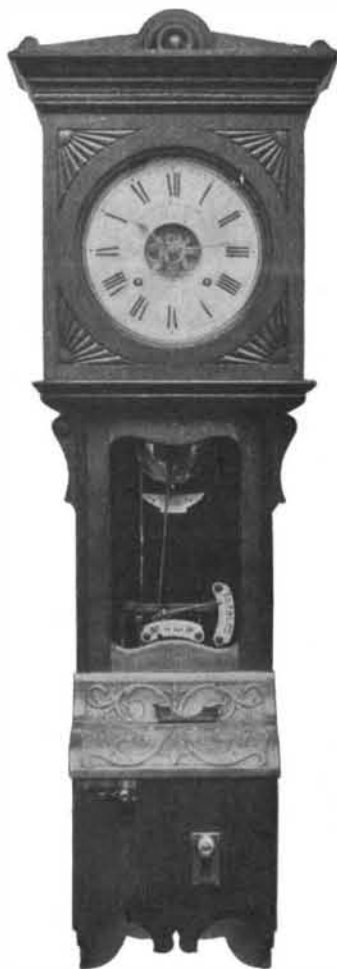
THE RECORDER AND CLOCK.

The time-printing apparatus is operated by a Seth Thomas clock having the usual gear-trains and springs. The shaft carrying the hands of the clock drives the type-wheels below, through the medium of beveled