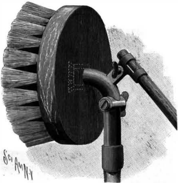
AN IMPROVEMENT IN CLEANING DEVICES.

To provide a device by means of which windows and walls may be effectively cleaned, the amount of water used being under the control of the operator, the brush illustrated in the engraving has been invented. Into the back plate of the brush screws the faucet of a hose. This faucet is provided with a plug by means of which the flow of water may be regulated. The faucet is also provided with lugs connected by means of a clamping screw with the eye of a socket secured to the operating handle. By the use of the clamping