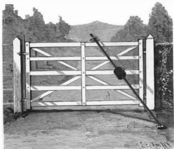
GREEN'S SELF-CLOSING GATE.

Referring to the accompanying engraving, it will be observed that, on the top bar of the gate, a roller is journaled which is engaged by an inclined rod fulcrumed at its lower end on a fixed support set at a proper distance from the hinge-post. A weight is held on the rod and can be fastened in any desired position by means of a set screw. To prevent the rod from leaving the roller when opening and closing the gate,