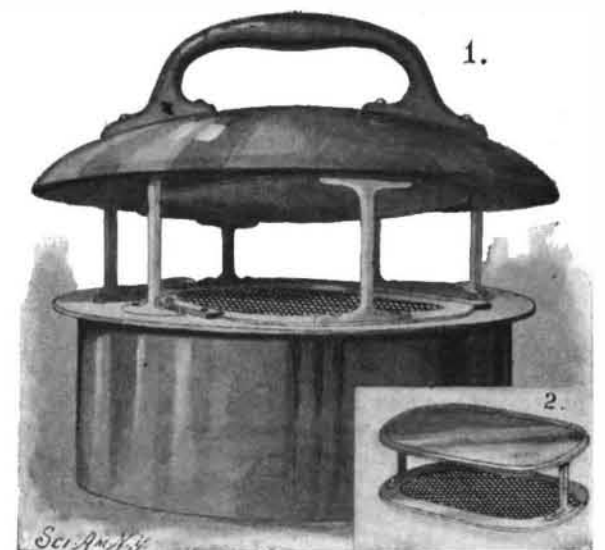
A NEW MILK-CAN COVER.

A milk-can cover has been patented by Elmer E. Harvey, Dolington, Pa., which is designed to permit thorough ventilation of the milk while cooling, so as to avoid the disadvantages incurred by hermetically sealing the can while the milk is still warm. The cover also permits the can to be sealed ready for shipment after the milk has cooled. Of our illustrations, the larger is a perspective view of the entire cover and the smaller a perspective view of the ventilating and sealing closures. The cover is provided with a stopper or