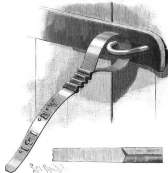
DE LAMATER'S CAR SEAL AND TAG.

The illustration represents an inexpensive device for convenient application to the doors of railroad freight cars, to seal the car, preventing its being accidentally opened and unauthorized abstraction of the contents. The improvement has been patented by Edgar De Lamater, of Ogden, Utah. The device is formed of a single strip of metal, the strip having at one end bent over edges or lips to form a passage, as shown in the small view, through which may be passed the other end of the strip, when the device is placed in position to seal the car door. After this has been done, the bent over edges and the end or tag portion of the strip are passed between the dies of a plier or similar tool, pro-