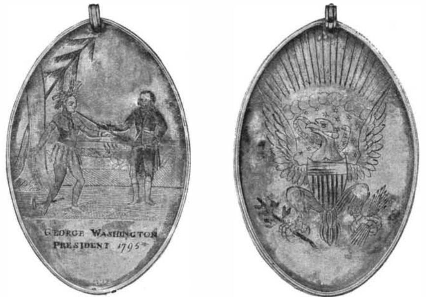
GREENVILLE TREATY MEDAL, OBTVERSE AND REVERSE.

By treaties made in 1768 with the Iroquois and Cherokee Indians, the two leading confederacies in the East, the Ohio and the Kanawha had been fixed as the boundary between the two races, the Indians renouncing their claims to the seaboard of the Delaware and the Susquehanna, while they were confirmed in their pos-