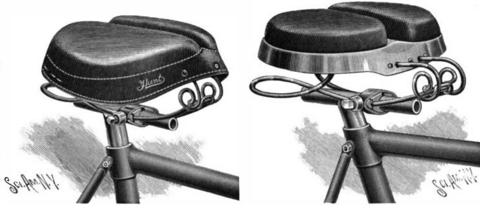
NEW TYPES OF BICYCLE SADDLES.

No one would suppose that the ancient Mexican civilization was far enough advanced to produce statues of terra cotta of natural size; and yet one has recently been found by an Indian in digging in a cavern near