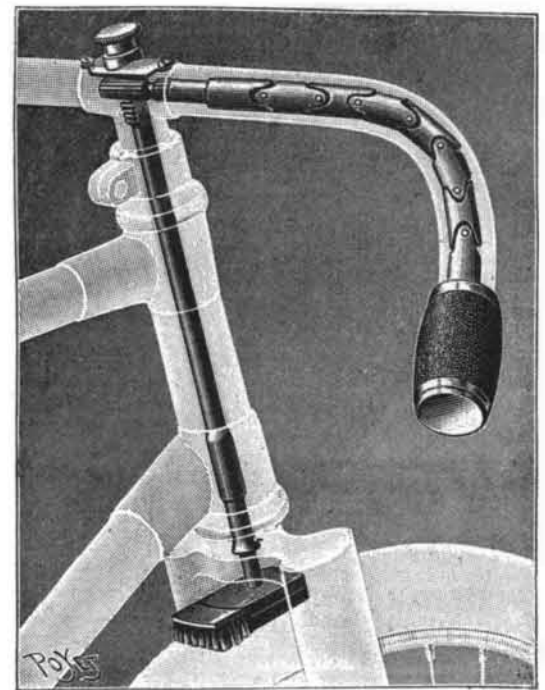
INVISIBLE BRAKE FOR BICYCLES.