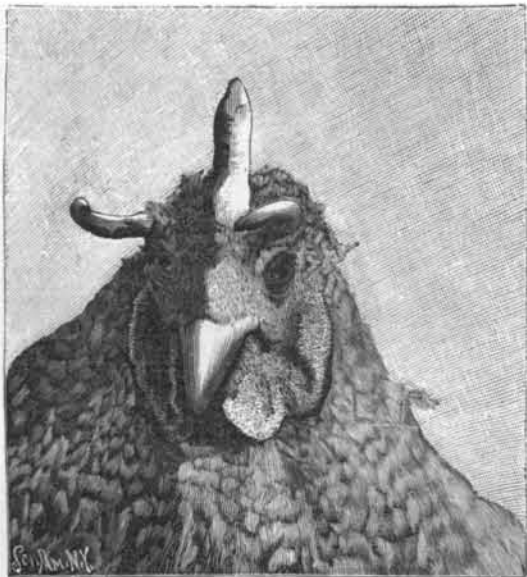
A HORNED COCKEREL.

Nature not infrequently makes serious mistakes in her handiwork, and although the dime museum managers and proprietors of catchpenny shows may be the greatest gainers, financially, by her misfits, a careful study of the monstrosities which occasionally appear in the animal kingdom is not without interest, even to the scientist. Although we might rightly question the value of any considerable number of such abnormalities in a synoptic collection of natural history specimens, they certainly have their legitimate place in any patho-