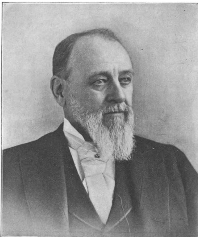
HAYWARD AUGUSTUS HARVEY.

One variety of these screws had two knobs on the surface of the head instead of a nick. The ordinary tapering screw and the gimlet pointed screw were also