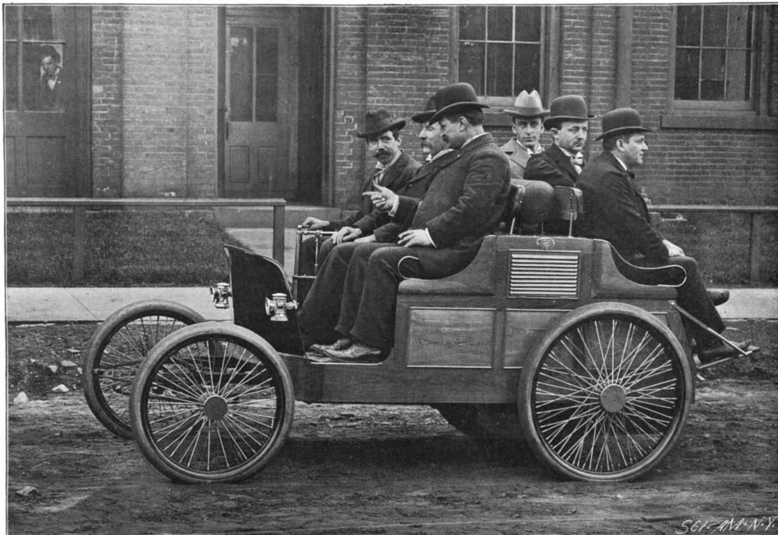
THE WINTON MOTOR CARRIAGE.

the table, the pipe being connected with any desired source of supply, and the upper surface of the table being corrugated or having concavities or cups. At the side of the fixed table is a swinging table, hinged at one end and its opposite end supported by springs, and extending over the upper end of this table is a steam spraying pipe, having a slit or series of perforations in its lower side, the spraying pipe being connected with a supply pipe controlled by a valve actuated by the swinging of the table, as indicated in the small figure. As the hot plate is held and moved about by tongs on the fixed table, water is constantly running over the table under the plate, the water in the concavities affording a suction to prevent the plate from jumping too much. After the scale has thus been loosened and partly removed, the plate is similarly handled on the swinging table, where the weight of the plate depresses the springs and lowers the upper end of the table, a movement which opens the valve and causes the discharge of steam upon the plate, to blow off the scale and entirely clean the plate. Upon removing the plate, the table returns to its normal position and closes the valve.