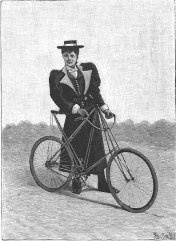
A NEW TYPE OF BICYCLE.

A curious type of bicycle was recently exhibited at the Crystal Palace Exhibition, London. We present an illustration of this new departure in wheel making. The Illustrated London News, in speaking of this wheel, describes it as follows: The frame is constructed on the cantilever system. It consists of twenty-one perfect triangles, is made entirely of steel, and will take any sort of wheels, spindles or chains; if necessary, the