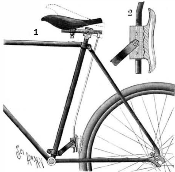
BORGFELDT'S BICYCLE BRAKE.

The illustration represents a bicycle brake of such construction that the brake may be applied by the rider throwing his weight rearward on the saddle, the dotted lines, as shown in Fig. 1, indicating the movement of the saddle and brake shoe as the brake is applied, while Fig. 2 shows the brake shoe and its attach-