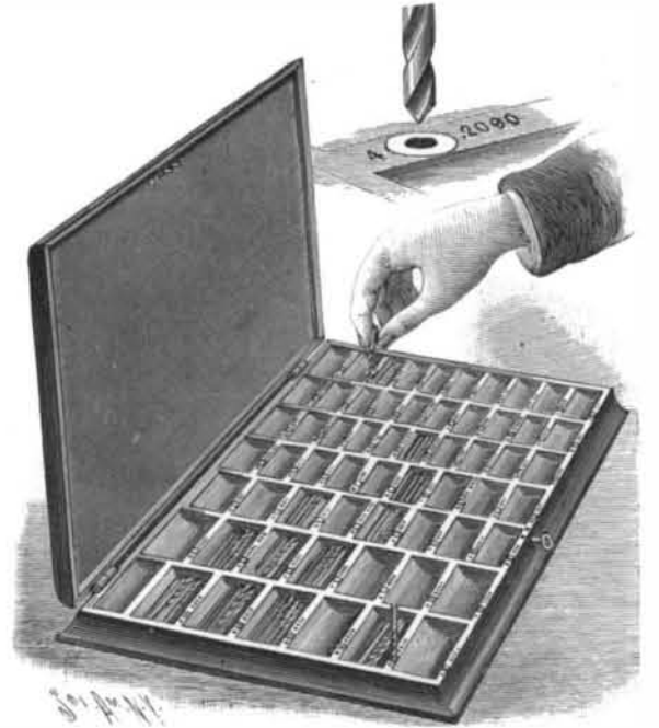
THE WEISS DRILL CASE.

A case in which to keep drills, so that it will always be easy to find just the drill wanted, is shown in the