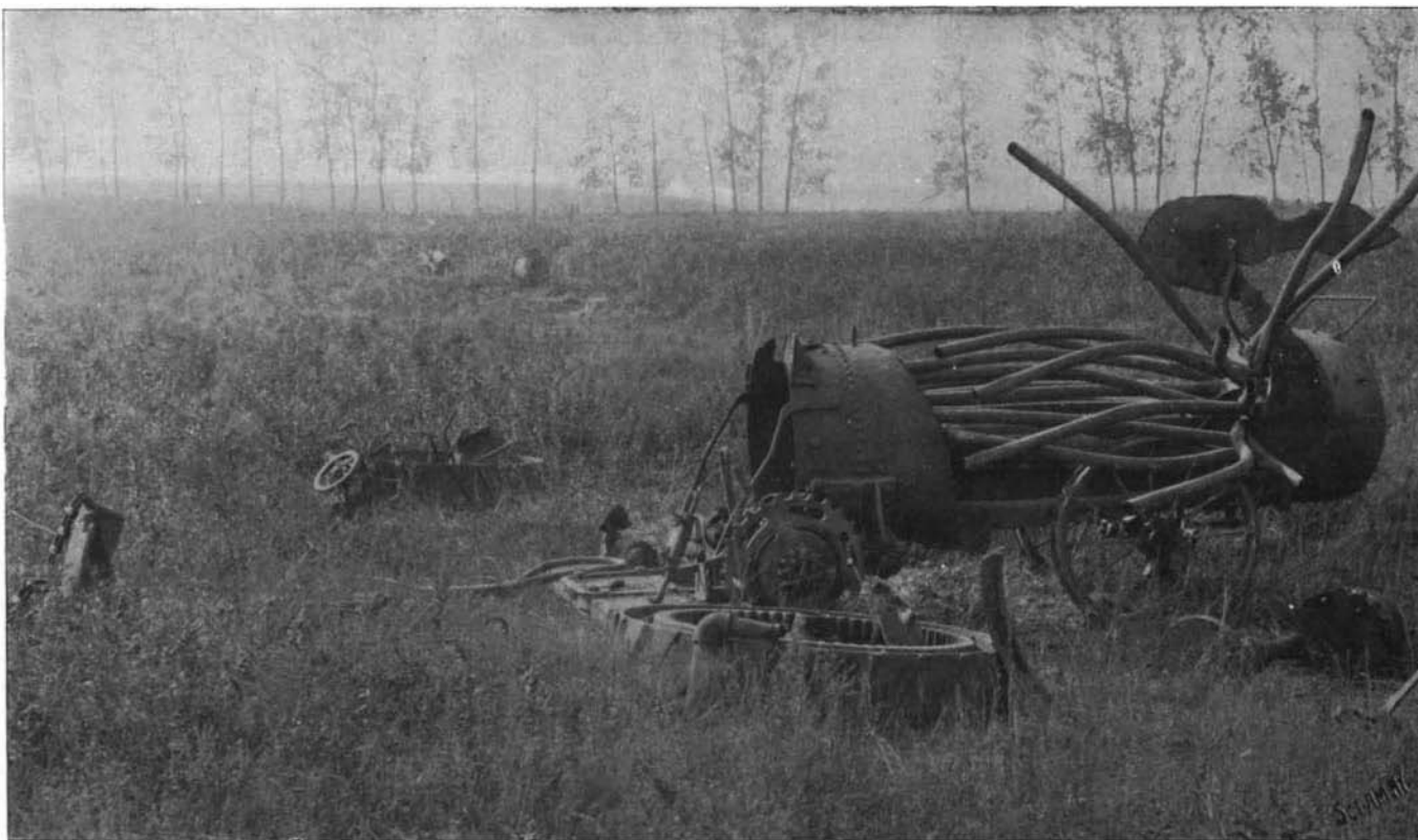
A TRACTION ENGINE BOILER EXPLOSION.