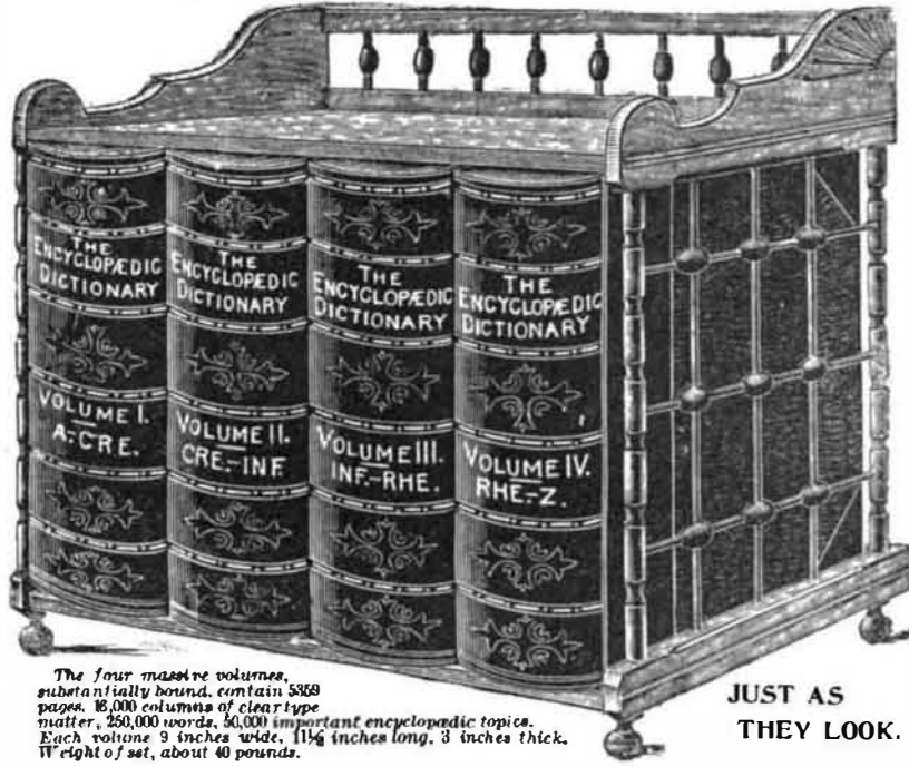
The four massive volumes, substantially bound, contain 5369 pages, 15,000 columns of clear type matter, 250,000 words, 50,000 important encyclopædic topics. Each volume 9 inches wide, 11 1/4 inches long, 3 inches thick. Weight of set, about 40 pounds.