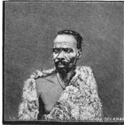
A SOUTH AFRICAN PRINCE.

there for three weeks, literally in a sling of skin and flesh. When it was removed it was found that the skin of the stomach had grown to the back of the hand. It was carefully treated, trimmed down to where it should grow, and a triumph in the surgery of skin grafting was made public.