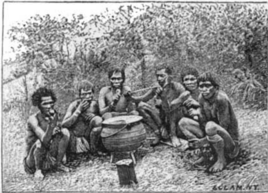
A NATIVE MEAL.

The parboiled hand of a man, devoid of skin on its back, was inserted in a puncture made between the skin and flesh of the man's own stomach and fastened