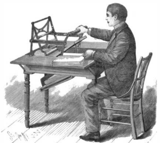
AN AUTOMATIC DUPLICATOR.

With the automatic neostyle an original is written either with the neostyle pen or ordinary typewriter on a sheet of patented stencil paper. The stencil is then laid on the printing platen, and a slight movement of the lever causes the frame to close, then the stencil is automatically held in the printing frame. All that is now necessary to do is to feed the machine and operate the lever. The ink is fed automatically, the supply being regulated by a small thumb screw. Copies can therefore be light or dark, according to the ink that is allowed to flow (a thousand copies can be taken without touching the ink fountain). This ink, as soon as it is deposited on the plate, is taken up automatically by two rollers which distribute it evenly, the ink plate revolving a quarter of a turn at each impression. The movement of the lever brings the printing roller across the stencil, the pressure being regulated automatically, thus insuring an even