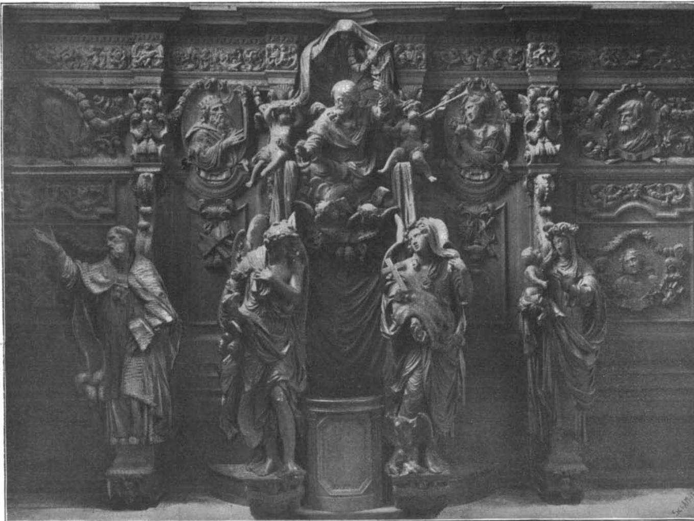
A RENAISSANCE WOOD CARVING IN ANTWERP.

A rather complicated method is based upon the purring sound caused by the meshing of the gear and pinion teeth. In order to calculate by this plan, it is necessary to carry along a tuning fork or a seven octave piano. If the tone is the same pitch as "middle C," which makes 264 vibrations a second, the teeth are meshing at the rate of 264 a second. If the number of