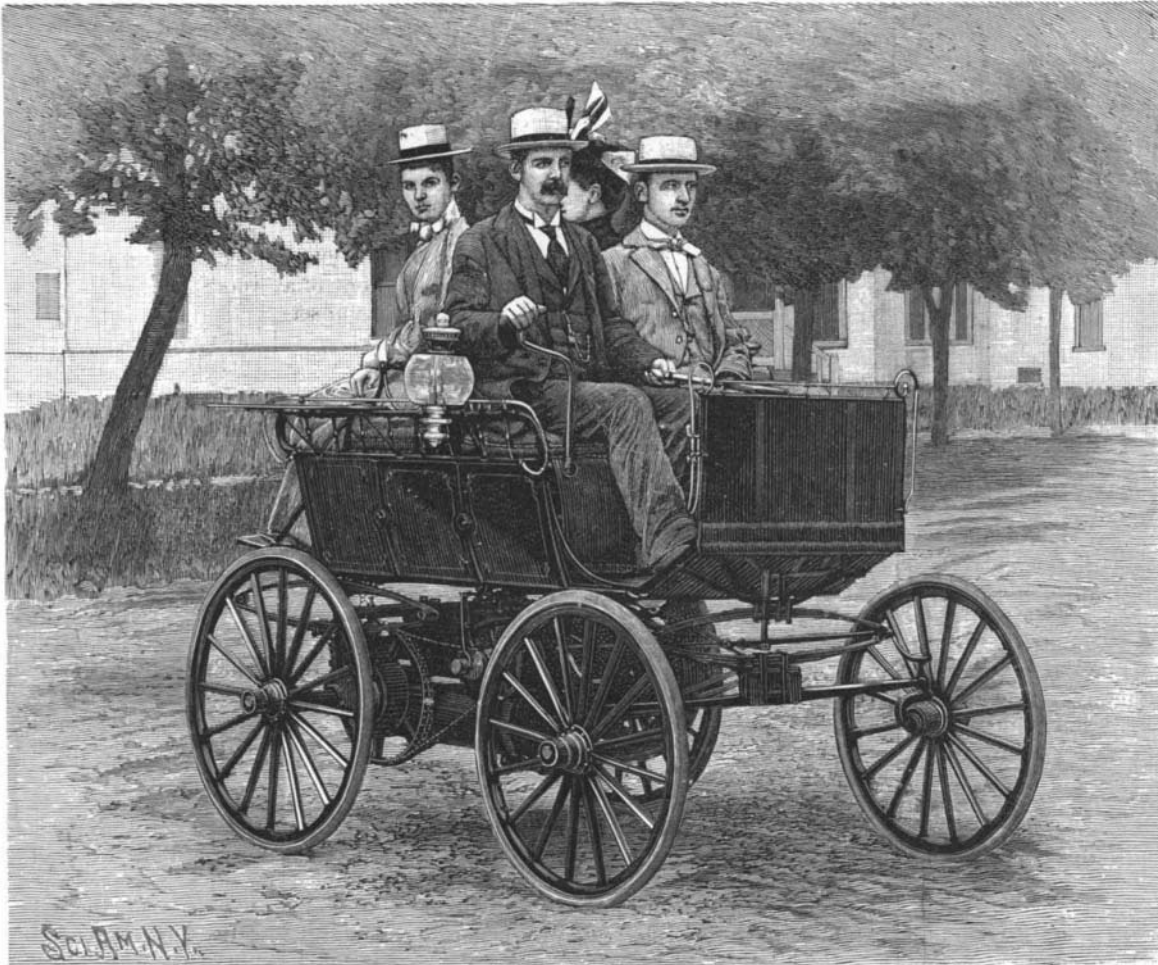
THE OLDS HORSELESS CARRIAGE.

BOOKS bound in the skin of departed friends are said by the London Figaro to be the fashion now in Paris. So are cigarette cases, tobacco pouches, pocketbooks, and prayer books made of the skin of notorious criminals.