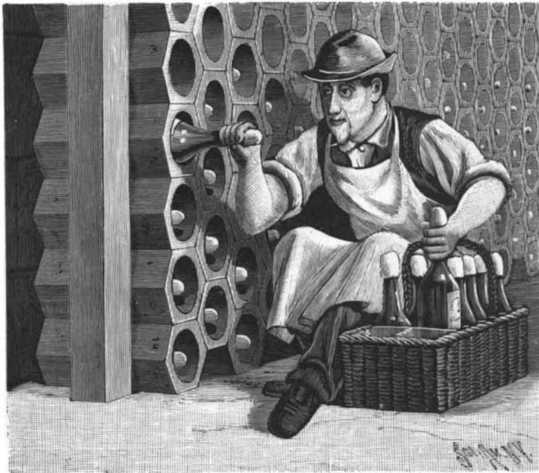
HONEYCOMB WINE BINS OF VITRIFIED CLAY PIPE.

are so arranged that the operator cannot, without using a wrench, put in fewer picks of filling per inch than the mechanism is set and loaded for. The improvement has been patented by Arthur A. Forbes, of St. Hyacinthe, Canada. Our illustration is a rear view at one end of the loom, showing the bearing of the free roller on the yarn on the beam, the roller being journaled in a fork integral with a rack sliding in a frame, and the rack having an aperture in which may be placed a pin to limit its movement when it is moved to set the mechanism. The rack may also, by means of engaging lugs and a screw in one side of the frame, be moved to bring it into or out of engagement with a pinion on a vertical shaft at whose lower end is a bevel wheel engaging a similar wheel on a horizontal shaft. On the latter shaft is a scroll or pulley having a spiral groove, which receives a wire passing over pulleys on the loom leg to a weight attached to its other end. The other end of the shaft is connected by bevels to a shaft extending longitudinally of the loom, and on the latter shaft is a pinion engaging a loose pinion on a parallel shaft above. On this upper shaft are pulleys, not shown in the illustration, to each of which is connected one end of a friction band encircling the head of the beam, there being a friction band for each head, and on the shaft are also rigidly secured parallel arms or levers on