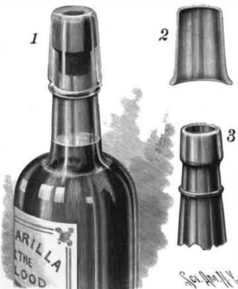
SMALL'S NON-REFILLABLE BOTTLE.

The invention shown in the illustration relates to that class of bottles known as "safety bottles," which are designed to prevent the refilling of the same after the contents have been removed. It has been patented by Mr. Henry C. Small, of 16 Cushman Street, Portland, Maine. The neck of the bottle is provided at its upper end with a deep fillet, and at a suitable distance below the bottom edge of the fillet an annular bead or rim is also formed on the neck. A glass cap,