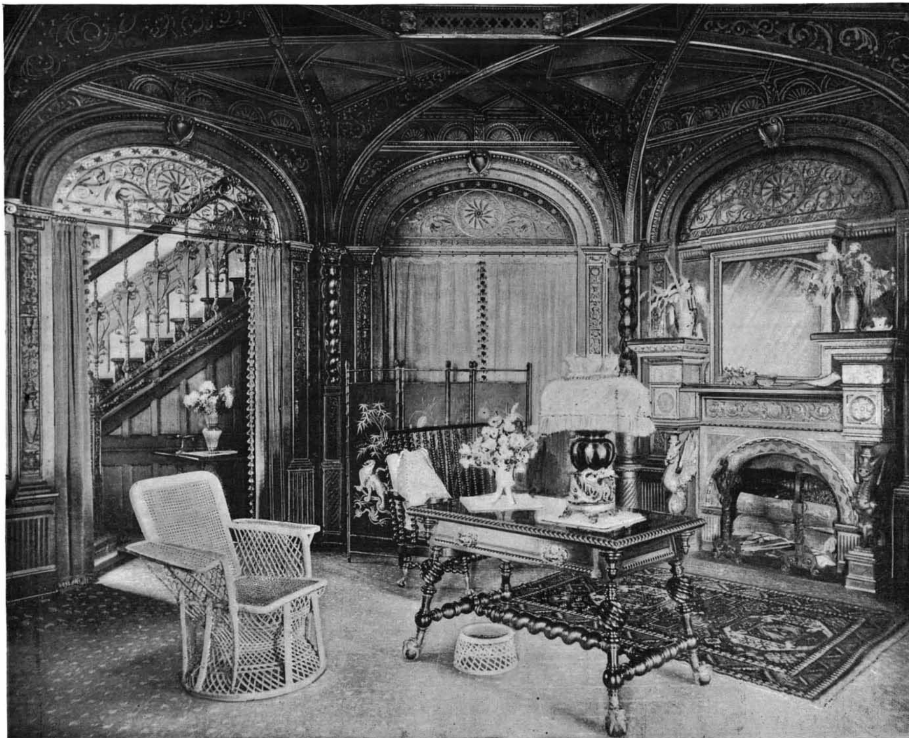
IRON AND COPPER IN HOUSE CONSTRUCTION AND DECORATION—MAIN HALL, SHOWING METAL CEILING AND WAINSCOTING.