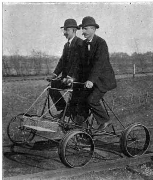
THE NEW HARTLEY & TEETER BALL BEARING INSPECTION CAR.

At the recent roadmasters' convention at Niagara Falls the Railway Cycle Manufacturing Company, of Hagerstown, Ind., exhibited two of their Hartley and Teeter inspection cars. A novel experiment was tried with one of them on the famous Gorge road. The car was run down the steep incline to the cantilever bridge and back. Our engraving shows the general appearance of the double seated inspection car. Ball bearings are used, the car being provided with a self-contained bearing case which covers the axle. In this case are placed the ball bearings, composed of two parts. All side strains caused by the weight of the rider are thrown upon the bearing case and do not bind upon the bearings or the axle. The axle itself is independent of the frame and can be removed by loosening the set screws