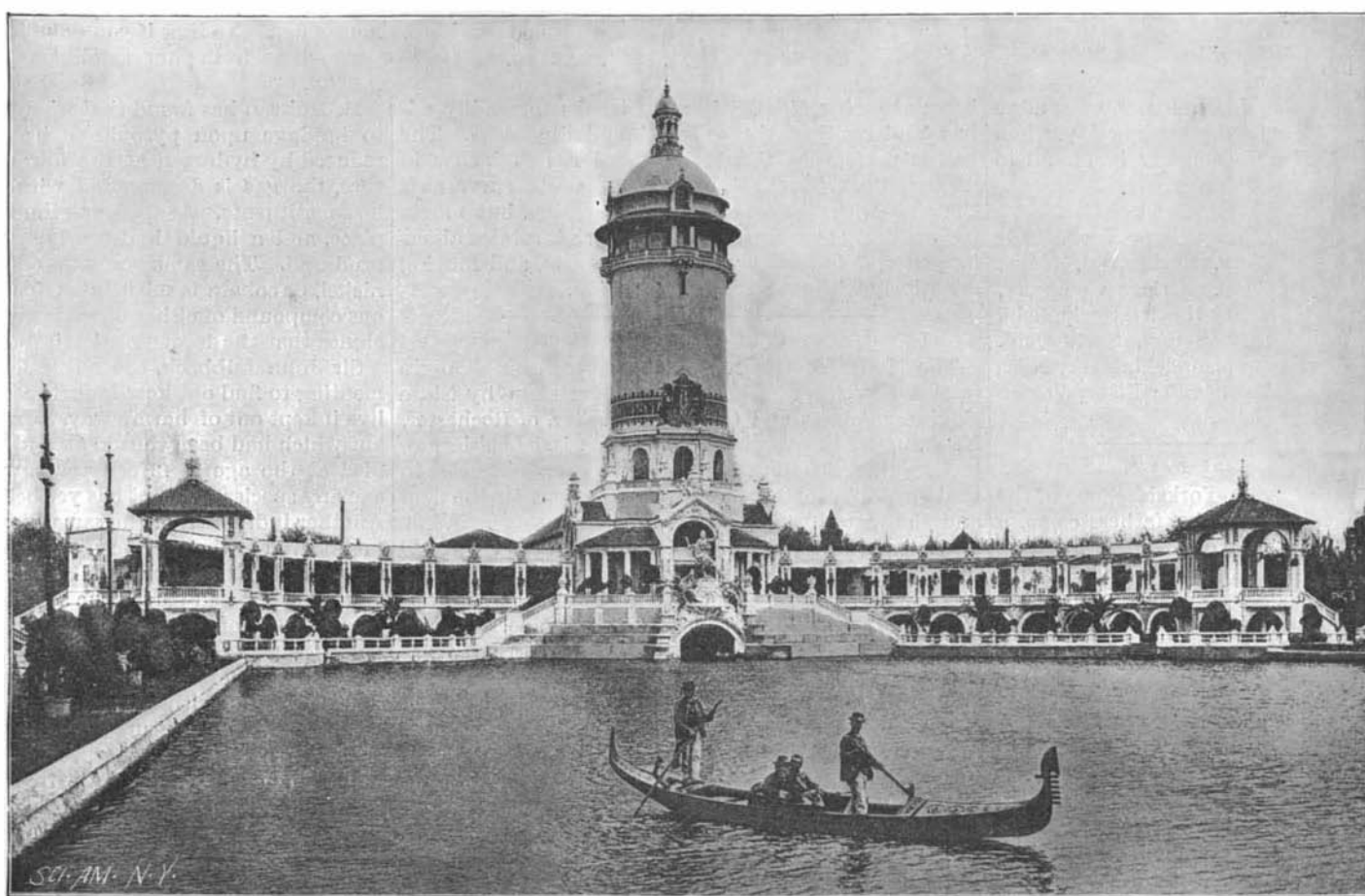
BERLIN INDUSTRIAL EXHIBITION—MAIN RESTAURANT AND WATER TOWER.

knife into the form of a little brush, after which the pieces are slowly dried to prevent splitting. In use, one end is moistened with water, dipped into tooth powder, and rubbed against the teeth until they look white. Brushes similar to these are said to be used at present in some parts of Turkey, but many Turks use ordinary European tooth brushes, though as even the most lax among them look upon the pig and all belonging to it as vile and unclean, they would as soon think of eating a pork chop or a rasher of bacon as of