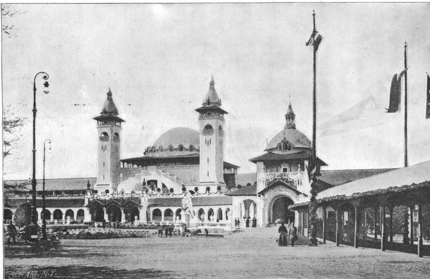
BERLIN INDUSTRIAL EXHIBITION—MAIN INDUSTRIAL BUILDING.

In the Dental Practitioner Dr. Parmele notes that in some old books published during 1600, directions are given for preparing certain roots that are used to clean the teeth, lucerne and licorice roots being specified. These roots are directed to be boiled and cut into pieces six inches long, the ends of each being split with a pen-