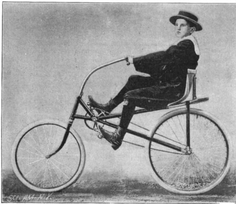
A NEW SWISS BICYCLE.

water of condensation, is subjected to the action of live steam from the nozzles and is affected by the heat from the coils, each and every grain of wheat being thus tempered to the same extent, while the bran may be toughened without injuring the germ, the flouring qualities, or the granulations of the grains of wheat. The wire cloth forming the bottom of the mixing chamber may be of different meshes and of different sizes of wire to afford the most effective cleaning surface and