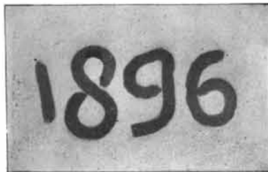
MADE WITH ONE-HALF SECOND EXPOSURE THROUGH PLATE HOLDER.

that seemed to give any promise of success, and are convinced that the ordinary spherical or bulb form is about the worst possible, while a comparatively small tube has so far given the best results.