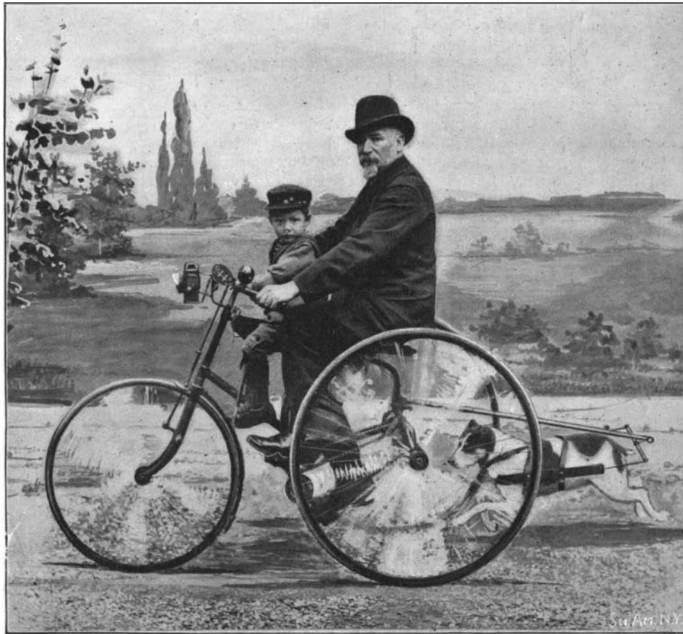
A CANINE AUXILIARY FOR A TRICYCLE.

The De la Vergne Company have, we believe, a new motor carriage in process of construction.