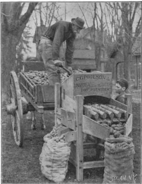
POULSON'S POTATO SORTING MACHINE.

The illustration represents a machine adapted to sort into different sizes not only potatoes and other vegetables and fruit, but a great variety of different substances, the size, strength and other details of the machine being varied accordingly. A patent was recently granted for the improvement to C. G. Poulson, Jr., deceased, of Linwood, Pa., of whose estate C. G. Poulson, Sr., is administrator. Within the box body of the machine is an inclined screening or separating table, mounted to have end motion, the table consisting of slats or bars, which are diamond-shaped in