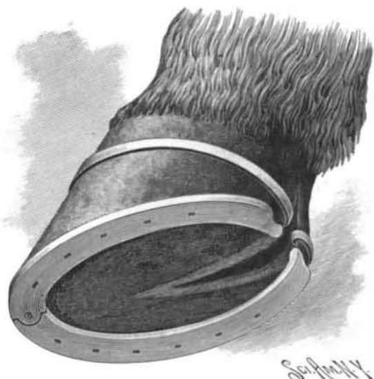
TRENKLE'S HOOF SPREADER.

For spreading the hoofs of horses or mules, to prevent and cure lameness, the simple and inexpensive