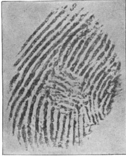
ENLARGED PRINT OF A MISPLACED GRAFT OF FLESH ON A THUMB, THIRTY YEARS AFTER IT WAS MADE.

The accompanying print is sent with a twofold object. First, for its intrinsic interest in showing how thoroughly and definitely a grafted slice of skin and flesh has established itself under its new conditions, retaining its original characteristics unchanged during thirty years. Secondly, because of its probable interest to surgeons in illustrating the ease and complete-