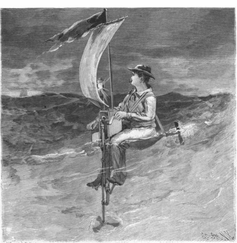
BARATHON'S PROPELLER LIFE BUOY.

In an inflatable rubber bag forming at once a seat and a buoy, as shown in the illustration, is a metallic bearing sleeve for a shaft on whose outer end is a screw or paddle wheel, waist and shoulder straps preventing the person using the buoy from being washed off. The forward end of the bearing sleeve is forked, the forks being pivoted to an air-tight casing or buoyant chest, against the rear side of which the seat may be folded up. The casing also forms a partial support, and contains the mechanical propelling devices, having at its under side bearings for the horizontal propeller shaft and on its front side bearings for a vertical shaft on whose lower end is a screw whose operation is adapted to uphold the buoy in the water. On the casing is stepped a mast, on which a sail may be set, and a downwardly extending frame supports a pedal shaft, by which may be operated, through a sprocket chain connection, a crank shaft having a bevel gear meshing with a bevel pinion on the vertical shaft, the latter shaft also having a bevel pinion meshing with a bevel gear on the forward end | mark to say four steps, but to be on the safe side we of the horizontal shaft, both shafts and their screws or call it three, and have made an illustration showing