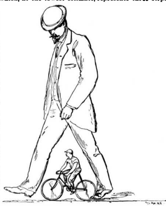
"A STEP," IN WALKING AND ON THE WHEEL.

same distance made by the bicyclist, with the same number of movements of the feet. Clearly the steps in this case must be seven and one-half feet each, which, at the lowest estimate, represents three steps