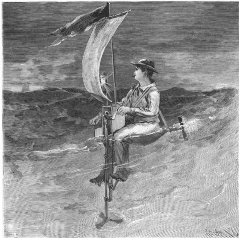
BARATHON'S PROPELLER LIFE BUOY.

In an inflatable rubber bag forming at once a seat and a buoy, as shown in the illustration, is a metallic bearing sleeve for a shaft on whose outer end is a screw or paddle wheel, waist and shoulder straps preventing the person using the buoy from being washed off. The forward end of the bearing sleeve is forked, the forks being pivoted to an air-tight casing or buoyant chest, against the rear side of which the seat may be folded up. The casing also forms a partial support, and contains the mechanical propelling devices, having at its under side bearings for the horizontal propeller shaft and on its front side bearings for a vertical shaft on whose lower end is a screw whose operation is adapted to uphold the buoy in the water. On the casing is stepped a mast, on which a sail may be set, and a downwardly extending frame supports a pedal shaft, by which may be operated, through a sprocket chain connection, a crank shaft having a bevel gear meshing with a bevel pinion on the vertical shaft, the latter shaft also having a bevel pinion meshing with a bevel gear on the forward end of the horizontal shaft, both shafts and their screws or paddles being thus operated by the pedals and by