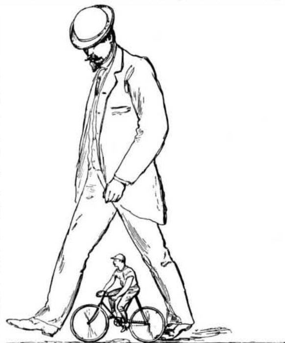
"A STEP," IN WALKING AND ON THE WHEEL.

same distance made by the bicyclist, with the same number of movements of the feet. Clearly the steps in this case must be seven and one-half feet each, which, at the lowest estimate, represents three steps