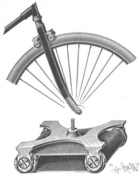
STEWART'S BICYCLE BRAKE.