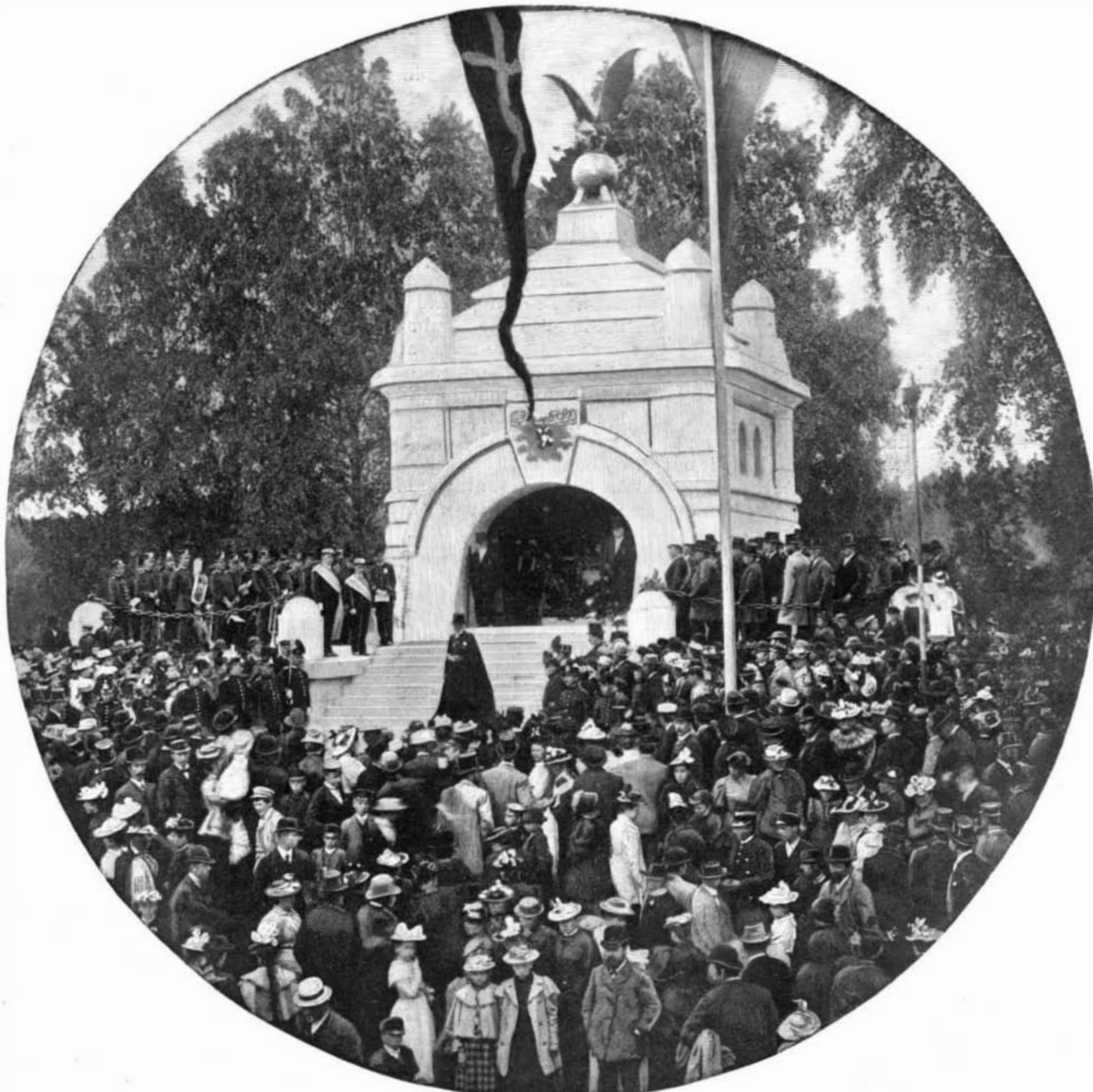
UNVEILING A MONUMENT TO JOHN ERICSSON AT FILIPSTAD SWEDEN.

A dispatch from Naples dated Dec. 3 says that Mount Vesuvius is in a state of eruption. Three distinct torrents of lava are flowing from Atrio del Cavallo, burning chestnut groves along their path and falling into the Vetrana precipice, between Monte Souma and Colline del Salvatore.