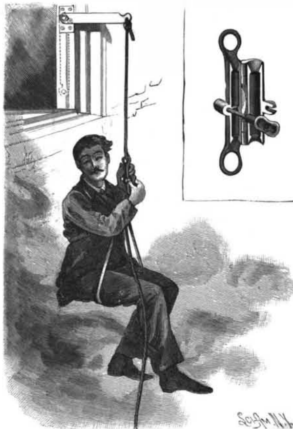
THE LEBER PATENT PORTABLE FIRE ESCAPE.

A simple and inexpensive portable fire escape, which may be packed in small compass to take but little room in a traveler's trunk or bag, is shown in the accompanying illustration. It has been patented by Victor Leber, and is manufactured by the Turner Machine Company, of Danbury, Conn. It consists of a clamp adapted to slide upon a rope, as shown in the small figure, the clamping or frictional pressure upon the rope being readily controlled by the person using the device. The two hinged parts of the clamp are provided with registering half grooves adapted for convenient use on different sizes of rope, and the clamp is held in gripping position upon the rope by a threaded locking lever on the outer end of which is a finger wheel. At the top and bottom of the clamp are rings through which the rope passes, affording a slight frictional brake, and at the bottom is also a double hook to which may be attached body and shoulder straps to support one