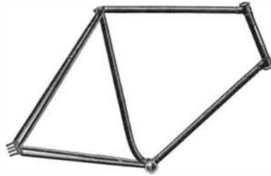
THE KEATING BICYCLE FRAME.

The Keating bicycle, manufactured by the Keating Wheel Company, Holyoke, Mass., claim to have been the first to put on the market a fully guaranteed light weight roadster. They have in past years placed upon the market the following weights: 35, 32, 25, 21; and