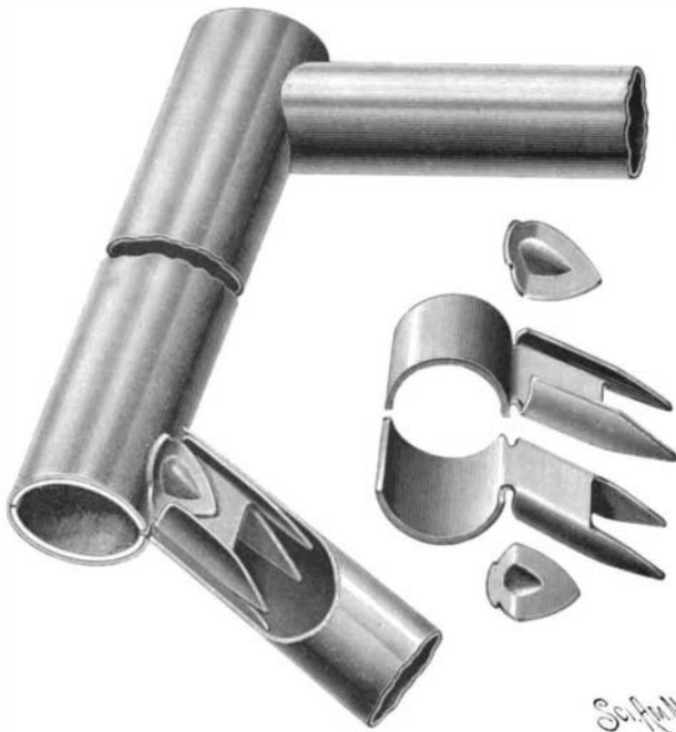
FRAME CONNECTIONS AND RE-ENFORCEMENTS OF THE BARNES BICYCLE.

Another important feature of the new Barnes bicycle is the method of adjusting and holding the handle bars and the seat post. In the case of the former there is a small hexagon cap screw on top of the bar which constitutes the only outside appearance of the fastening. When the handle bars are raised to the desired height, the tightening of this cap screw draws a circular wedge up inside of the handle bar post, which,