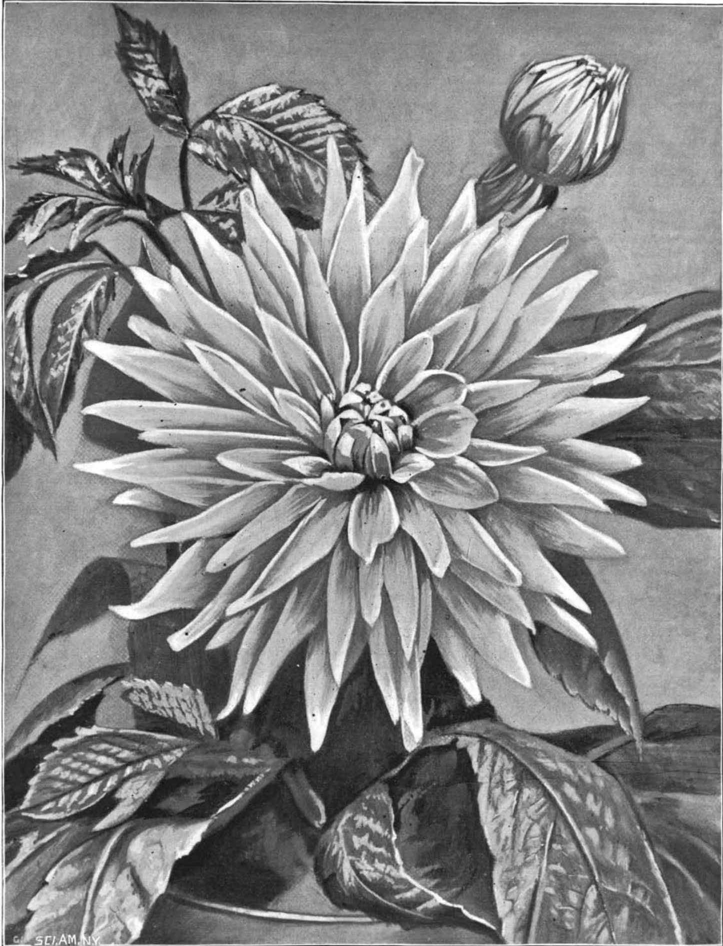
CACTUS DAHLIA, MRS. FRANCIS FELL.

The number of blast furnaces in activity in the United States at the commencement of November, 1894, was 181, their aggregate weekly productive capacity being 158,866 tons. The corresponding number of furnaces in operation at the commencement of August, 1894, was 135, their aggregate weekly productive capacity being 115,356 tons. At the commencement of May, 1894, there were 127 furnaces in operation, their aggregate weekly productive capacity being 110,210 tons; at the commencement of February, 1894, 125 furnaces, with an aggregate weekly productive capacity