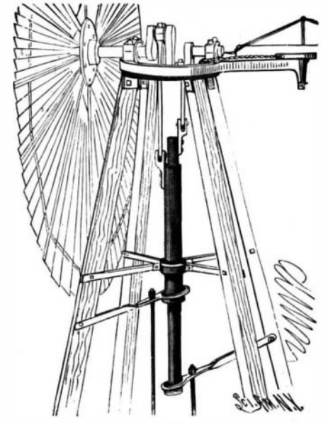
ERICKSON'S PUMP GEAR FOR WINDMILLS.

With the construction shown in the engraving the wind wheel is free to turn to the wind without affect-