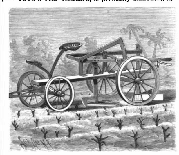
DANOS AND HAYDEL'S SUGAR CANE CULTIVATOR.

The platform of the truck is narrow, and supported centrally under it is a triangular scraper with a knife at its apex or front edge, the convex edge of the knife dividing the soil and severing vines, weeds, etc., in its path. The knife is attached by means of a shank to the standard of the scraper, which extends upward and is pivoted to a link adjustably attached to a hand lever fulcrumed just back of its forward end to an up right on the platform. Extending rearwardly from this upright is a rack upon which the lever has a guided movement, being provided with the usual thumb latch to engage the rack. A second lever, pivoted on a rear standard, is pivotally connected at