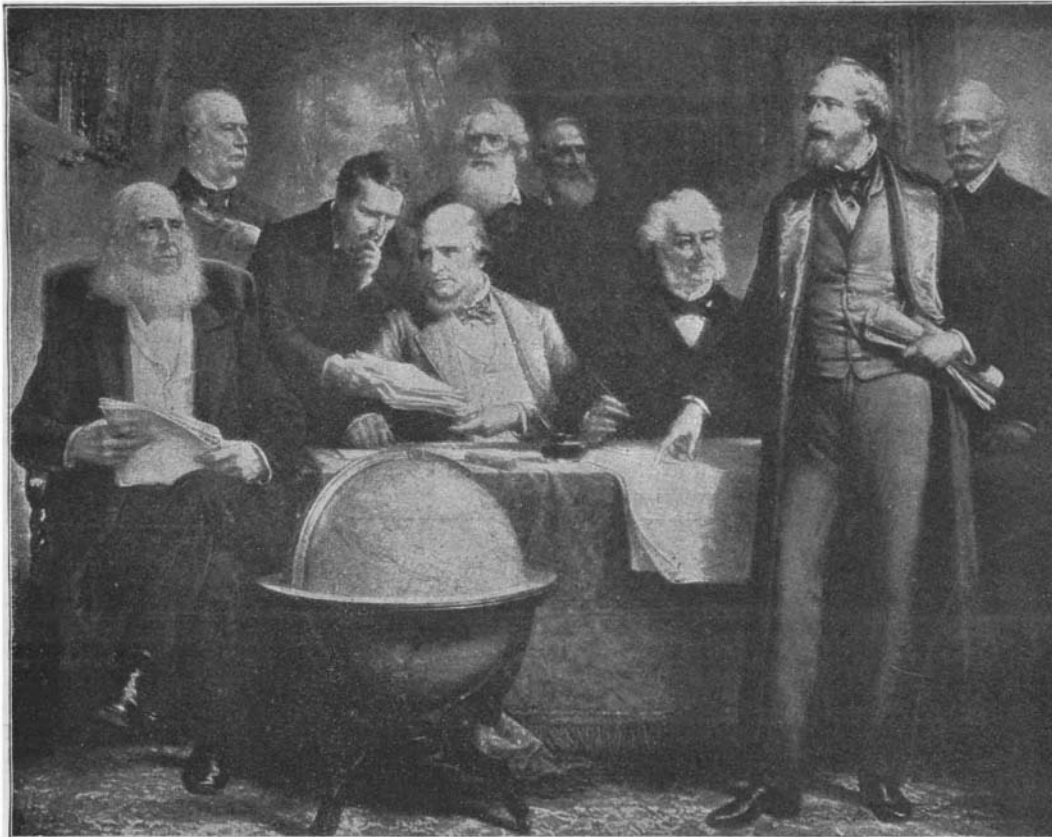
Peter Cooper. Chandler White. Marshall O. Roberts. Moses Taylor. Cyrus W. Field.