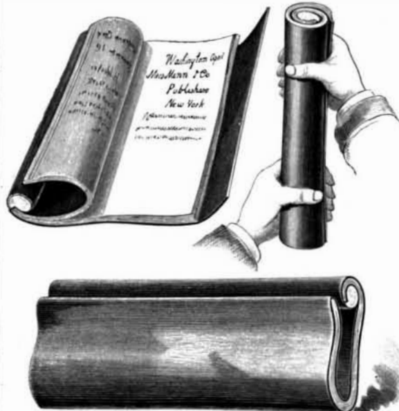
BUSHNELL'S ROLLING COPYING BOOK.

The illustration represents a perfect letter-copying book in which copies may be made of letters written