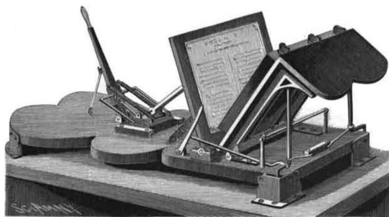
MAURER'S PRINTING PRESS.