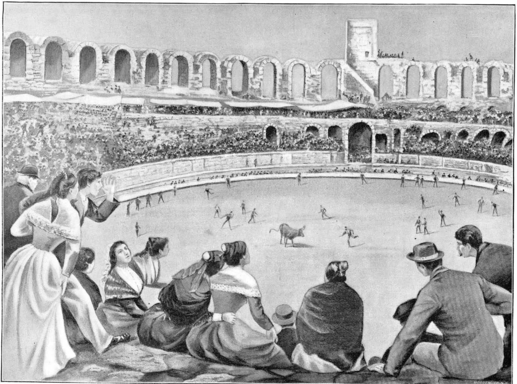
BULL TEASING IN THE ARENA OF ARLES.

The photographers of the Paris Observatory have just finished for the Academy of Sciences the clearest view ever secured of the moon. They have photographed her surface in sections, which fit, making a great image five feet in diameter. The work is so perfect that towns, forests, and rivers would be perceptible if they existed.