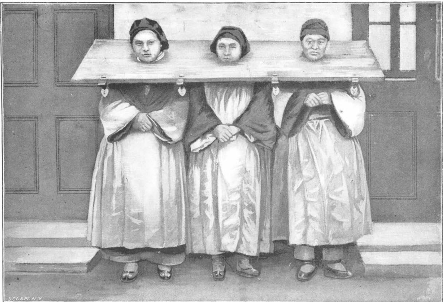
A CHINESE MODE OF PUNISHMENT.

The following thermodynamical problem is stated and solved by the Engineer: "A boy eats two ounces of ice. Let us see what is the approximately thermodynamic equivalent of the work he has made his interior do, assuming he takes five minutes to eat it. In melting the ice he will require eighteen units to reduce it to water. To raise it in temperature to that of his inside he will require seven more units, or a total of twenty-five British thermal units. Taking the mechanical equivalent as 777 foot-pounds, this will be equal to 19,425 foot-pounds. If the boy weighs 100 pounds, he will have called upon his stomach to do as much heat work as would, with a machine having unit efficiency, raise him 194 feet high, or a rate of heat extraction equal to nearly an eighth of a horse power."