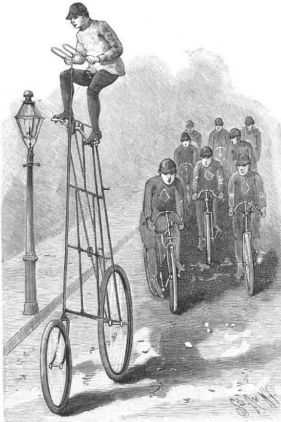
THE EIFFEL TOWER BICYCLE.

One of the most curious sights that has lately been seen in the streets of New York is what has felicitously been called the Eiffel Tower Bicycle. This machine is constructed on the same principle as an ordinary safety, but it has a frame superstructure which carries the rider at a distance of some ten feet from terra firma. This machine is frequently seen on the avenues of the city, and the rider easily overtops the ordinary lamp post along the route of travel. He seems to have