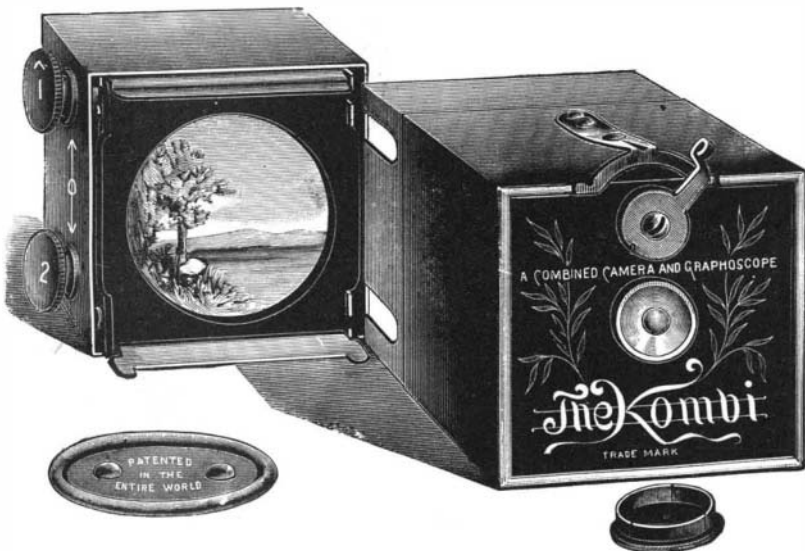
A COMBINED CAMERA AND GRAPHSCOPE.

showing the detachable rear part opened to exhibit the roll holder and with the time exposure cap and rear cap removed. The negatives are taken on a strip of sensitized film, each strip capable of receiving